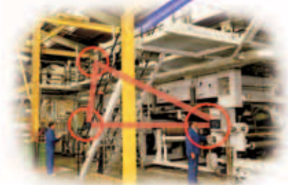
Printing & Converting Machinery Large Machines with Multiple HMI Stations